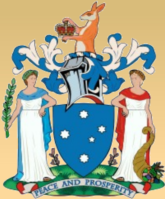
Coat of arms of Victoria