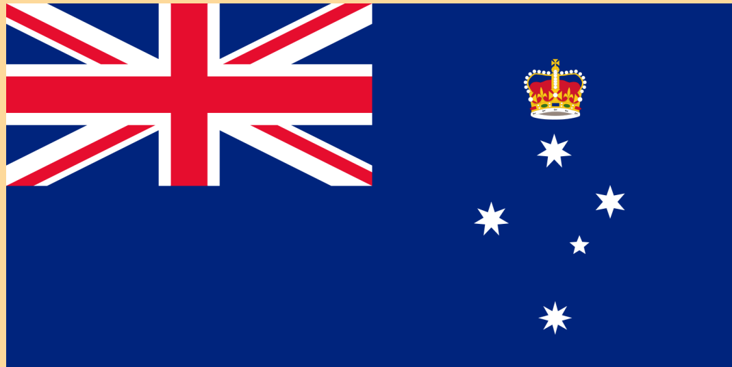
Flag of Victoria