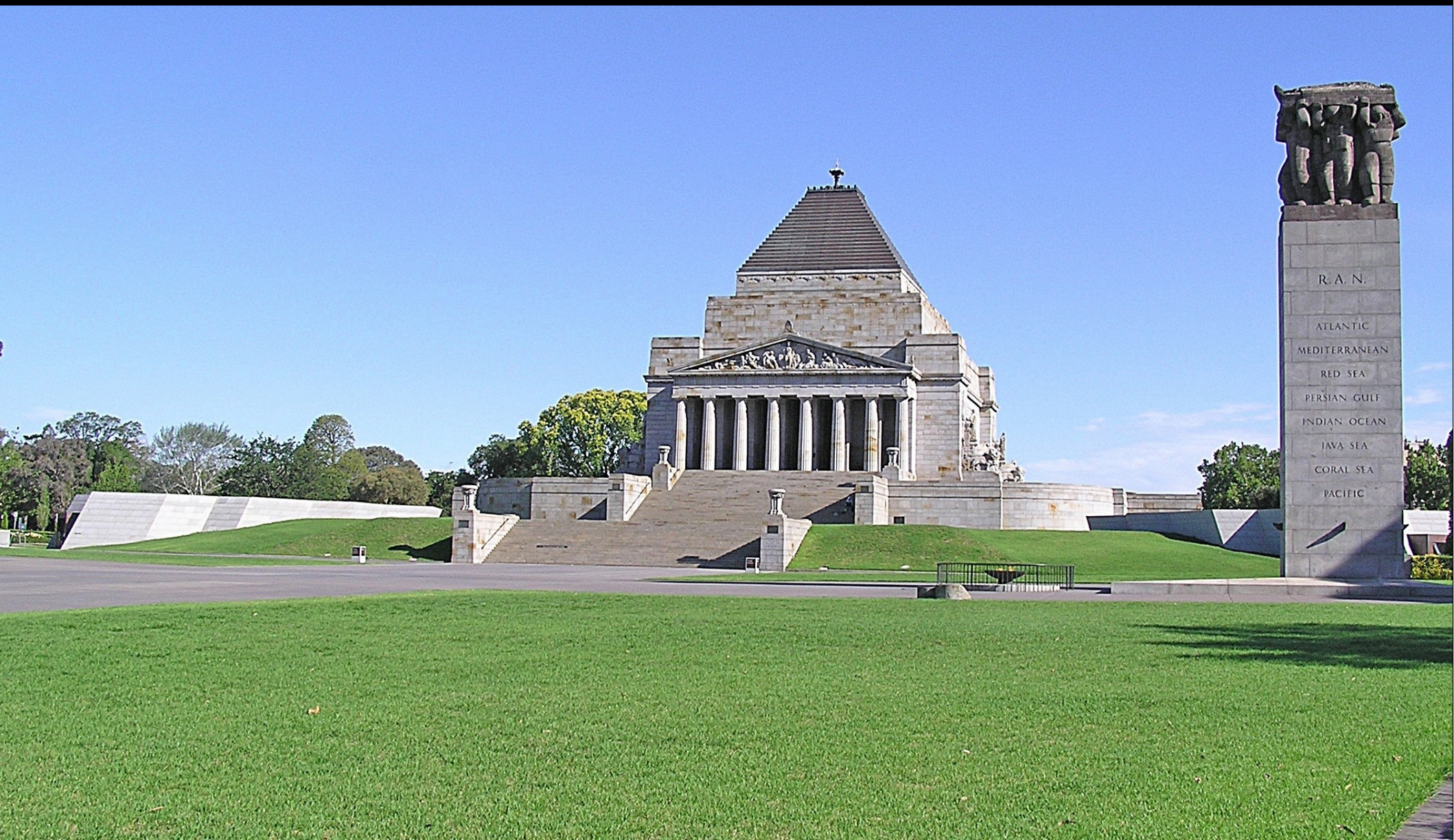
ANZAC - Australien and New Zealand Army Corps