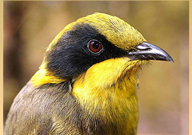
the Helmed Honeyeater is Victoria's state bird